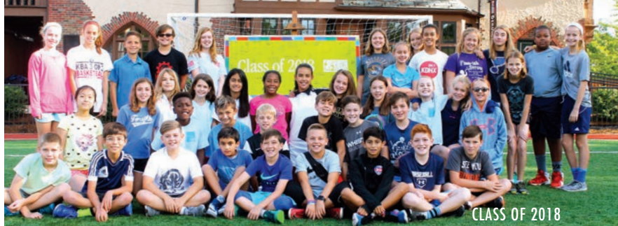
CLASS OF 2018