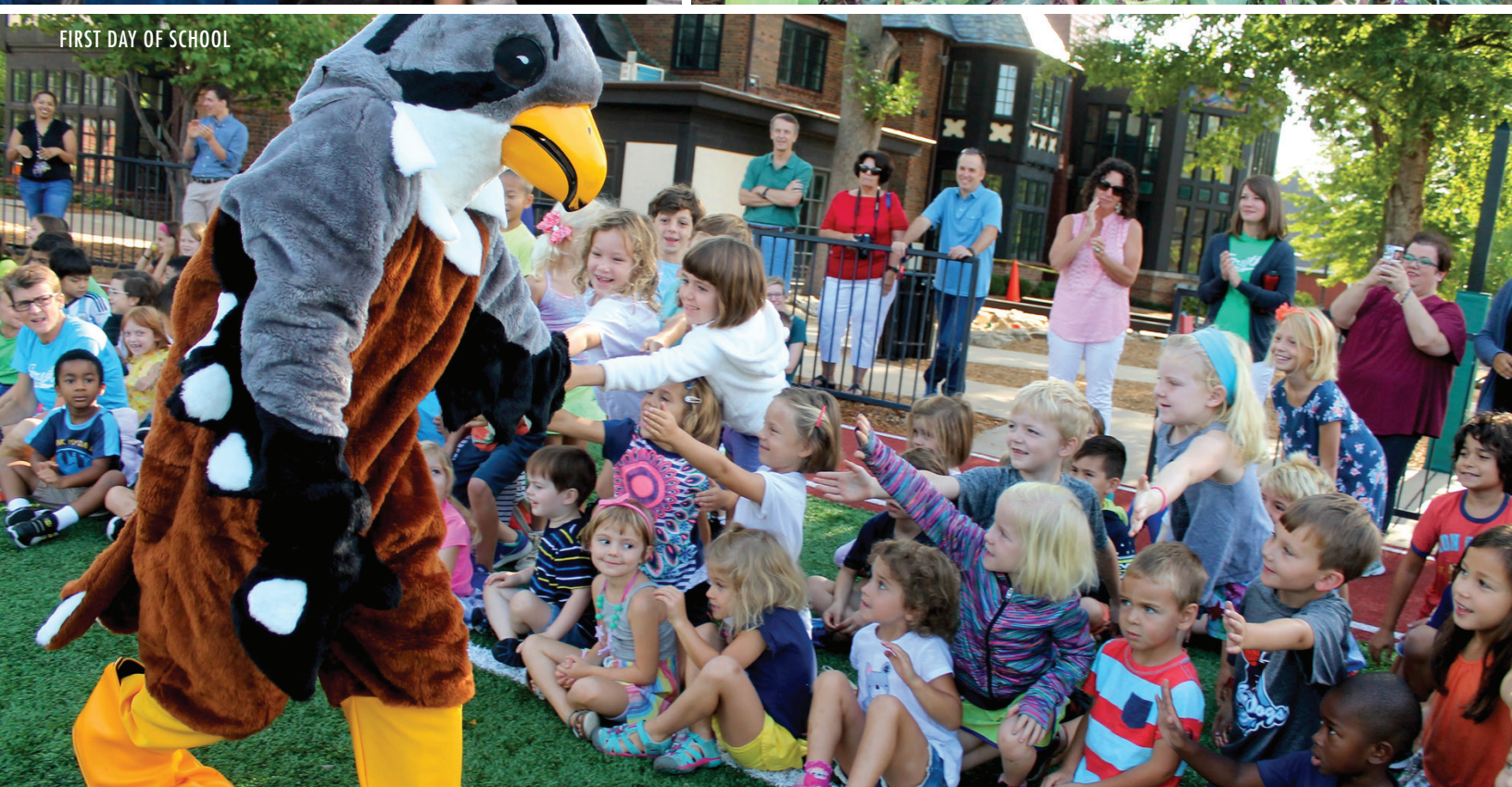
FIRST DAY OF SCHOOL